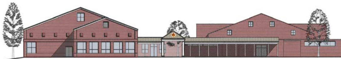
New Student Recreation Center