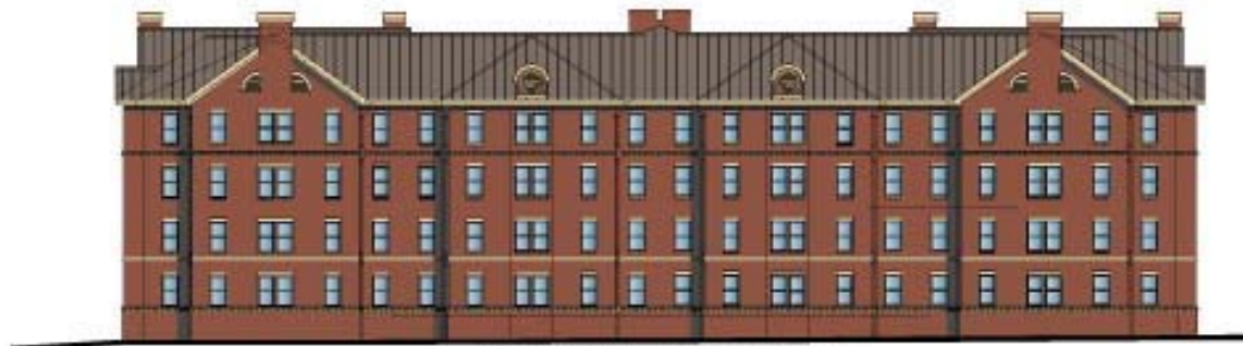
BUILDING 200 - REAR ELEVATION