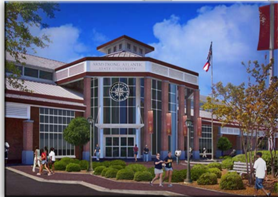
Armstrong Atlantic State University Continuing Education Center