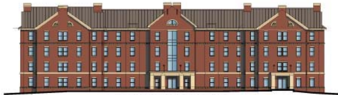
BUILDING 200 - FRONT ELEVATION