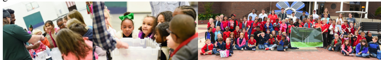
Figure 3: Pictures from the recent renewable energy workshop

Strides that are made today have the potential to leave long-lasting effects on generations to come. When I see the sparkling eyes of the elementary school students full of curiosity, awe and wonder, I feel that we are already making strides that will have a significant impact on our future generations