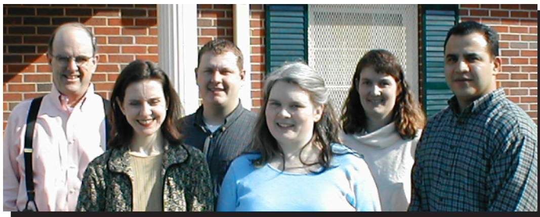
The OIIT Customer Services Team

can be found. In GALILEO's case, almost every message submitted through GALILEO's Contact Us (formerly Leave a Comment) form passes through the HelpDesk. This is the primary way in which librarians, media specialists, teachers, students, library patrons, and technical staff contact GALILEO, so the HelpDesk handles quite a lot of submissions from this form: over three hundred each month. In many cases, the HelpDesk staff members use their own knowledge of GALILEO, their workstation/browser support expertise, and their knowledge of existing system-wide or local problems to help people immediately. At other times, they gather the necessary ( continued, page 6 )