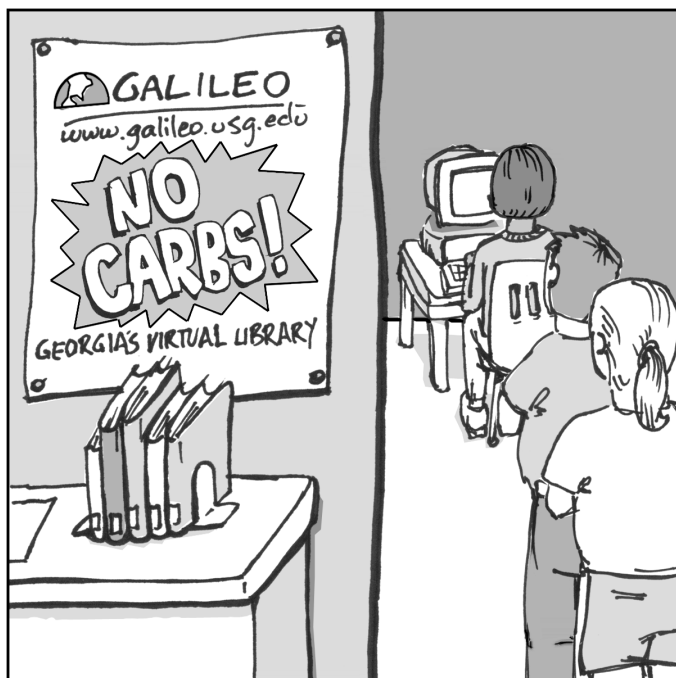
GALILEO's latest marketing strategy.