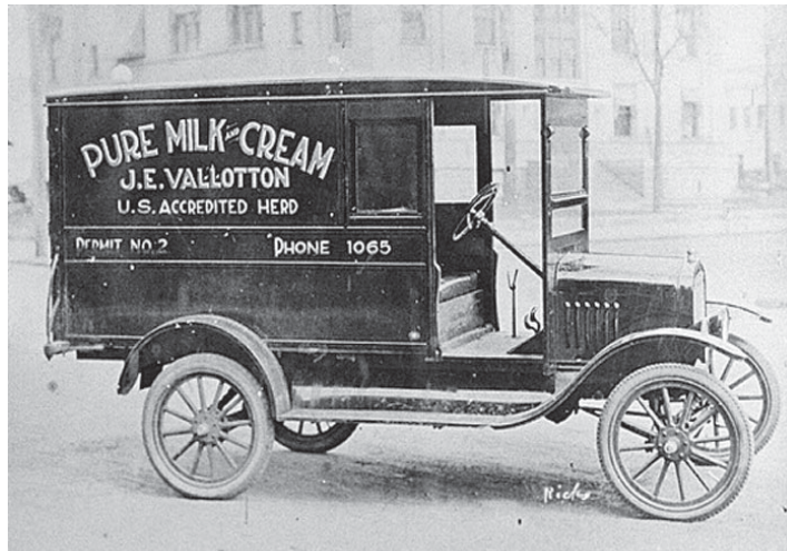
Dairy truck, Valdosta, 1922