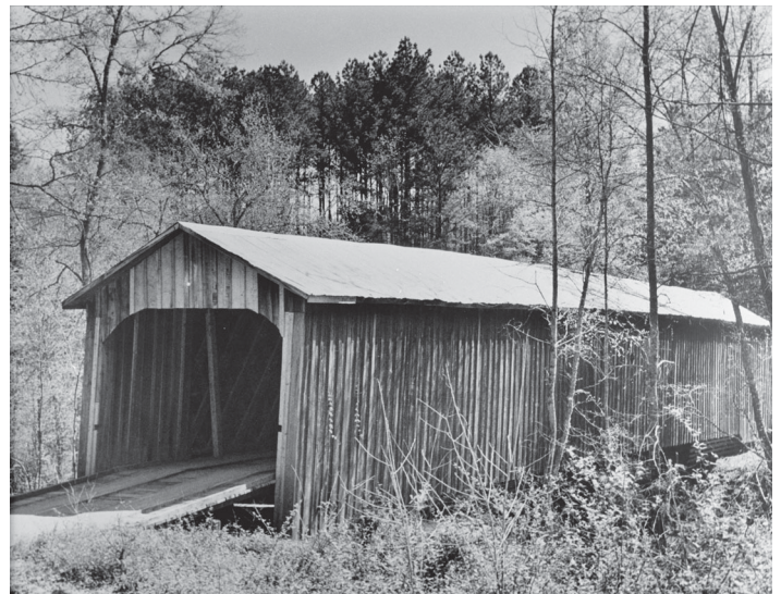
1874 covered bridge over the Apalachee River on the Barrow-Walton County line

for the Humanities in 1977. The Georgia Archives staff visited county seats and other locations around the state, traveling in a converted school bus, its sides repainted with the Vanishing Georgia logo. On board, the photographer would duplicate photographs, returning the originals to the donors. Field archivists interviewed the donors, collecting the stories behind the images. By the mid-1990s, the Georgia Archives had accumulated a collection of 18,000 photographs dating from the 1850s to the 1980s. Selected images appeared in Vanishing Georgia , a book published in 1982 by the University of Georgia Press.