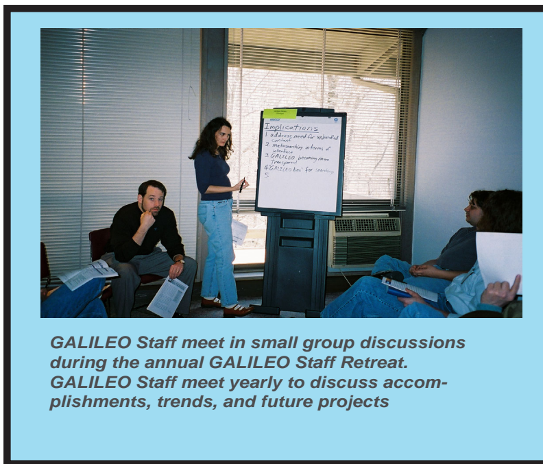
GALILEO Staff meet in small group discussions during the annual GALILEO Staff Retreat. GALILEO Staff meet yearly to discuss accomplishments, trends, and future projects

The Digital Library of Georgia is a GALILEO initiative based at the University of Georgia Libraries. For more information about the DLG, contact the director at tgraham@uga.edu .