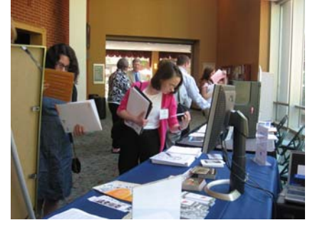
GALILEO Users browse the GALILEO Exhibit Booth at GOLD/GALILEO