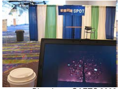
Blogging at GAETC 2008