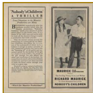
1920 Film Circular from Macon's Douglass Theatre