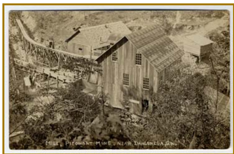
Piedmont Mine near Dahlonega, Ga, ca. 1910

Metasearch is the ability to search multiple databases simultaneously from a single search box.