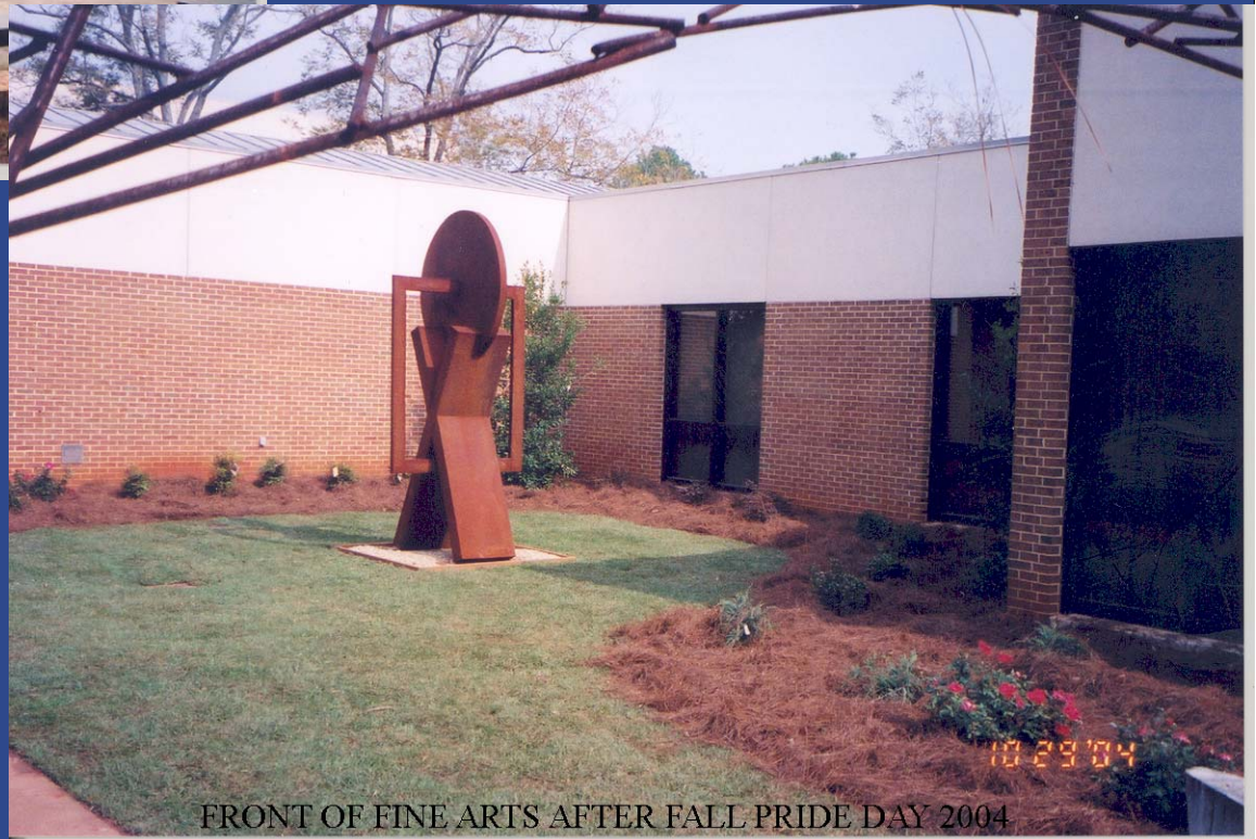
FRONT OF FINE ARTS AFTER FALL PRIDE DAY 2004