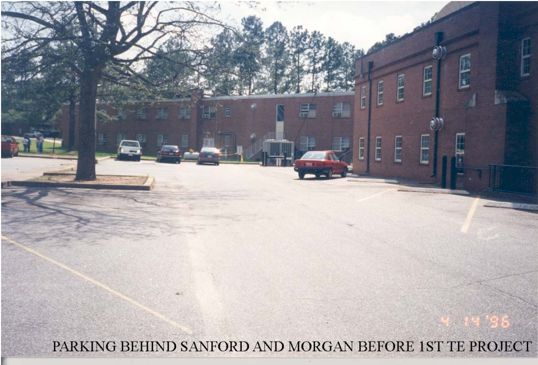
PARKING BEHIND SANFORD AND MORGAN BEFORE 1ST TE PROJECT