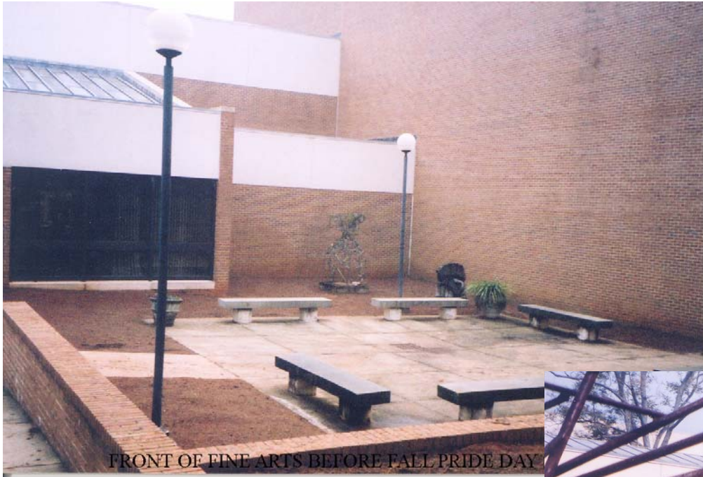
FRONT OF FINE ARTS BEFORE FALL PRIDE DAY