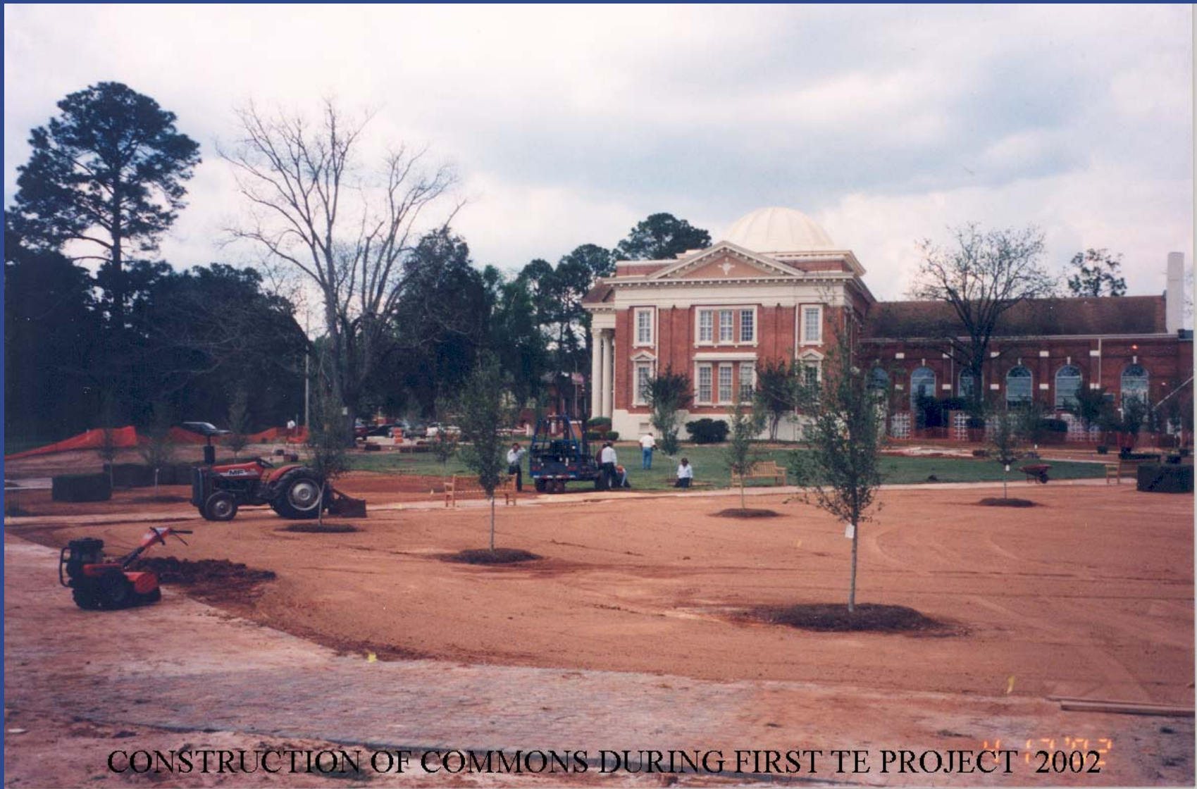
CONSTRUCTION OF COMMONS DURING FIRST TE PROJECT 2002