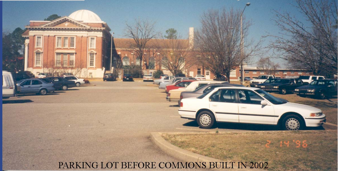
PARKING LOT BEFORE COMMONS BUILT IN 2002